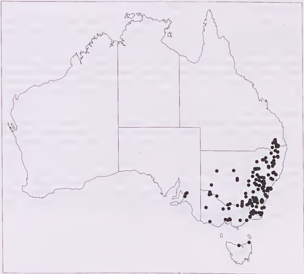
Fig. 3. Distribution of specimens of Cymbonotus lawsonianus in Australia. (data courtesy Australias Virtual Herbarium)

Typification: in his protologue, Beauverd describes the achenes of Arctotis australiensis as glabrescent or glabrous, winged, the wings lateral, inflexed, with whole margins, very similar to C. lawsonianus . His illustration of an achene of A. australiensis on page 45, Fig. IV (3) looks like C. lawsonianus . What is curious is that an illustration on the same plate Fig. IV (10) is supposed to be an achene of C. lawsonianus but looks more like C. preissianus Steetz, although this name is not mentioned anywhere in his study. Further, he goes on to distinguish A. australiensis (from C. lawsonianus ) by the achene that has